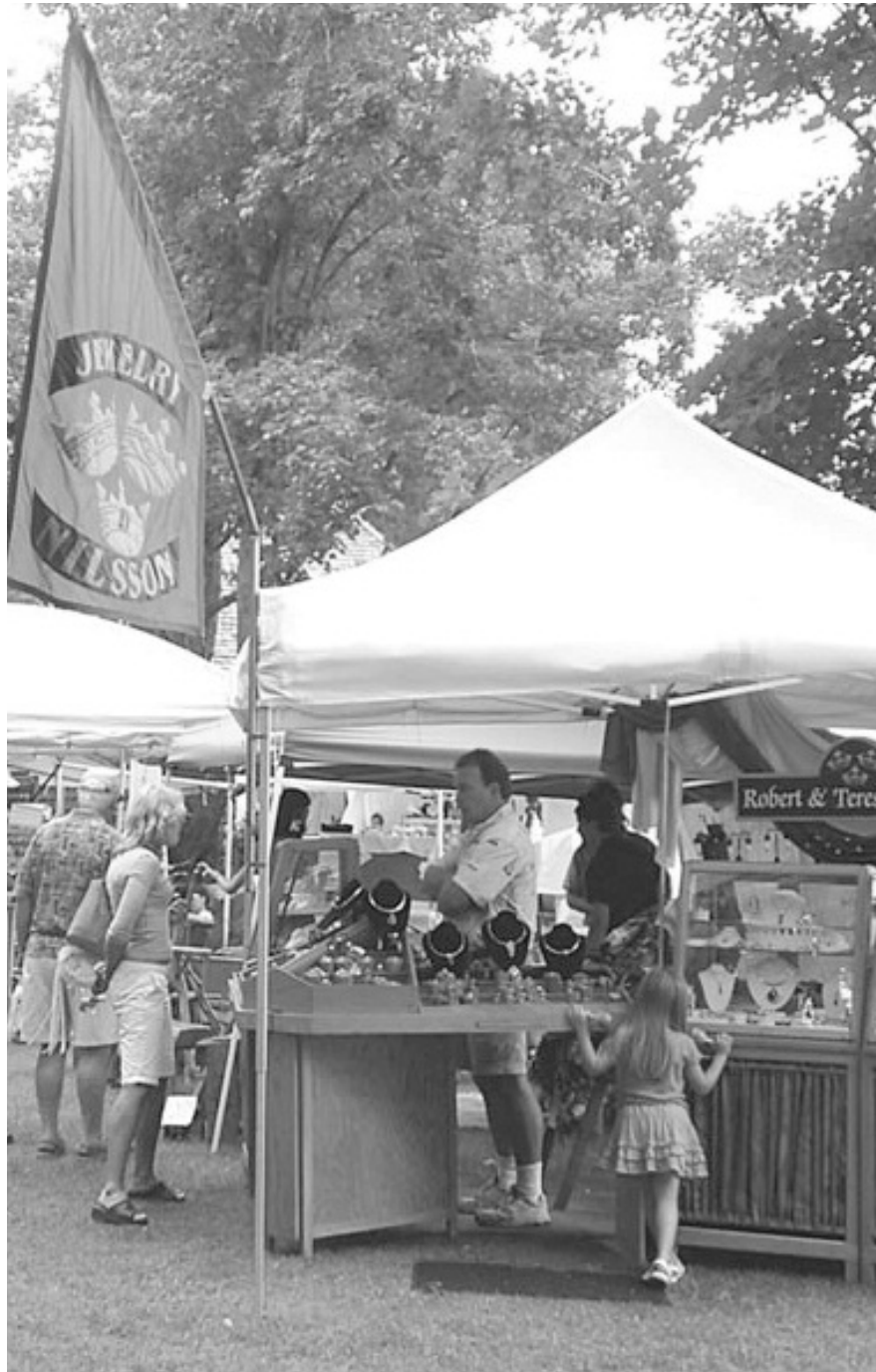
It's the 51st Annual Portside Arts Fair, and it takes place next weekend, August 3rd and 4th, at historic Elm Pointe located just a few minutes north of downtown East Jordan off M-66.

Admission to the Arts Fair is free, though donations to benefit the Historical Society will be accepted at the gate. On site concessions, a free