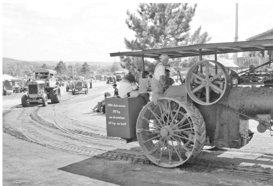
Flywheelers2013Pt2Photo3; The Parade of Power, a captivating procession of vintage machinery and automobiles, takes place Thursday, Friday, and Saturday at 2 pm.