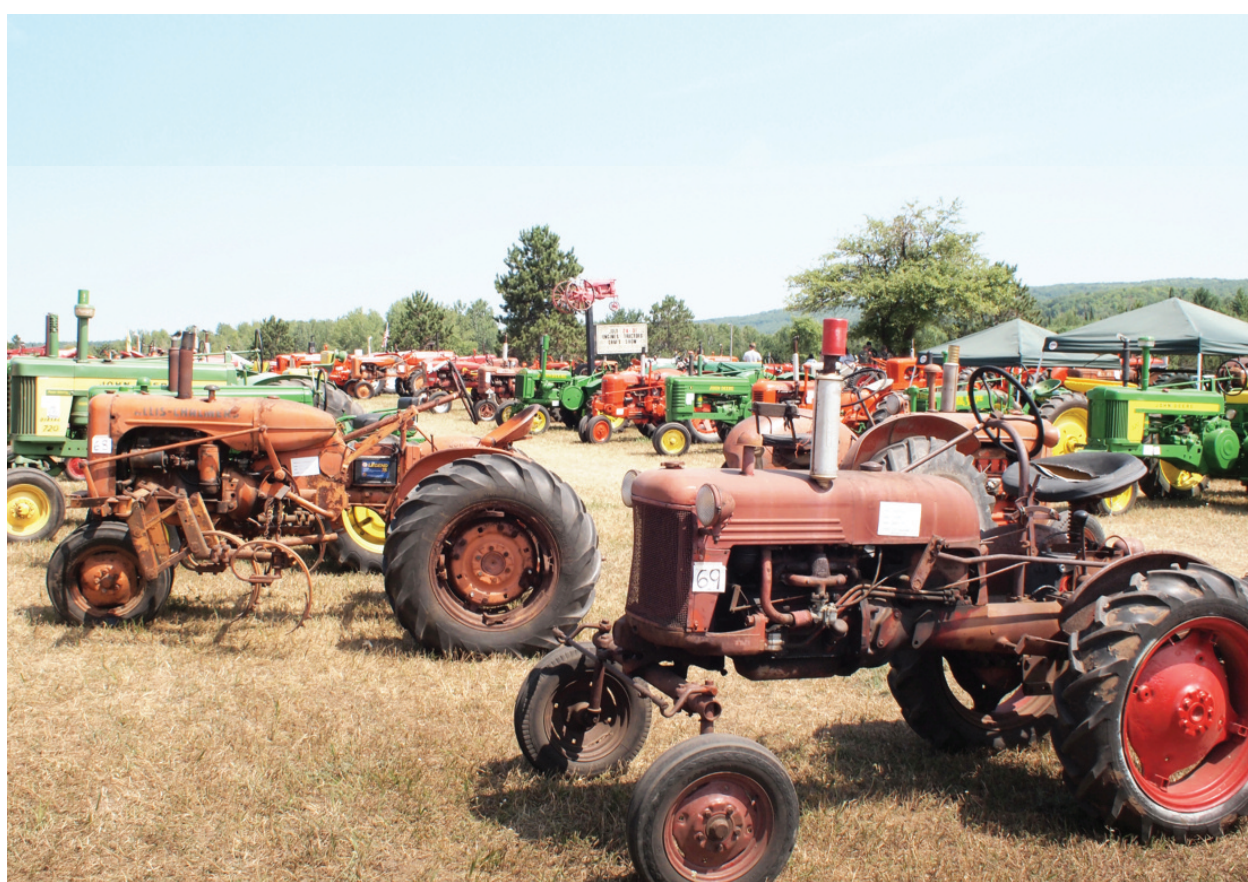
Antique tractors and machinery of virtually every make and model will be on display this weekend at the 26th annual Walloon Lake Antique-Tractor Engine & Craft Show from Thursday, July 25th through Sunday the 29th.

Standard Mail US Postage PAID Gaylord, MI Permit No. 70