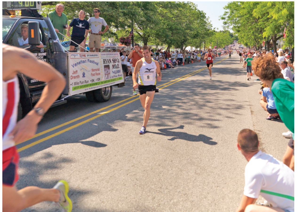
Two Venetian Festival athletic events will take place on Saturday morning. The Drenth Memorial Footrace, with a "Family Mile," 5K and 10K runs will begin at 9 am on Bridge Street, and the Ryan Shay Mile will begin on Bridge Street at 10:30 am.

For a complete schedule of events please visit www.venetianfestival.com