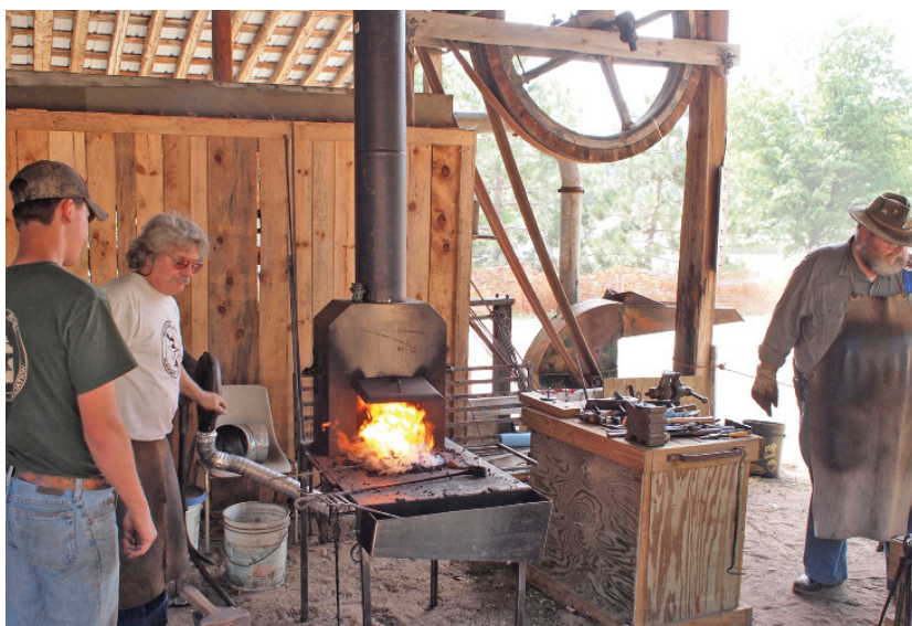
The amazing art of blacksmithing was a favorite demonstration among attendees. Other demonstrations of time-honored skills on the Flywheeler Clubs expansive grounds included a working sawmill, shingle mill, veneer mill, and new this year is a grist mill demonstrating how different grains were once ground into flour using two huge millstones.

There is an exciting "Parade of Power" which takes place each day at 2 pm, featuring a procession of vintage tractors and farm-related equipment travels around the show grounds. Shoppers will