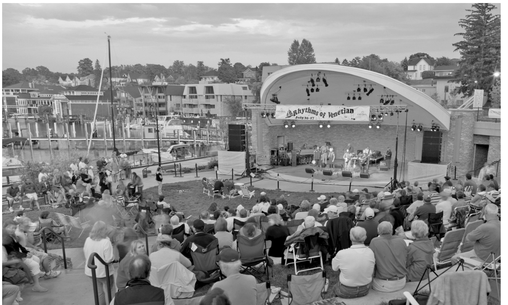
The Charlevoix Chamber of Commerce has selected the Charlevoix Venetian Festival as the Business of the Month, recognizing the organizations longstanding commitment in helping to make Charlevoix an outstanding community in which to live, work and play.

Charlevoix Venetian Festival, Inc. was formed by several community oriented individuals and assumed ownership of the Vene-