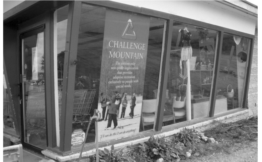
Challenge Mountain Resale Shops, located in Boyne City and Petoskey, offer a wide range of donated clothing and household items for sale with proceeds utilized to help support Challenge Mountains' ongoing mission.

1158 S. M-75, just east of Boyne City toward Boyne Falls (where the facility was actually once located), and the Petoskey store is at 2429 US 31 North across from Houghton Gas.