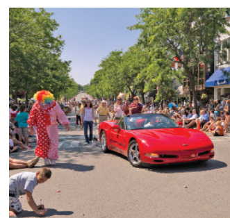
The 83rd Annual Venetian Festival is underway...and there is plenty excitement in store for attendees at the "big town festival with the small-town appeal" through Saturday, July 27th.