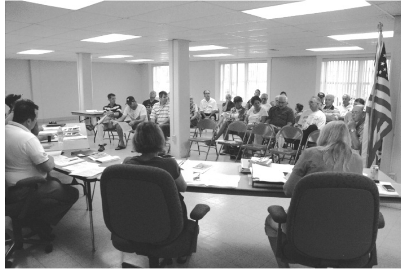
Residents spoke out against a proposed slalom ski course on Lake Ellsworth at the July 22 Banks Township Board meeting.